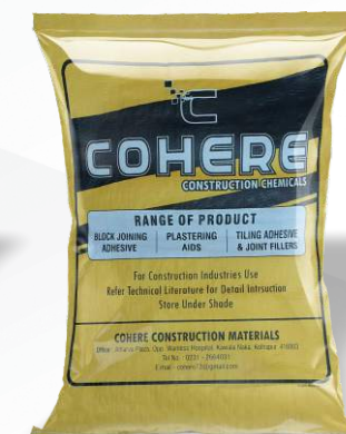
Tile Adhesive And Joint Filler