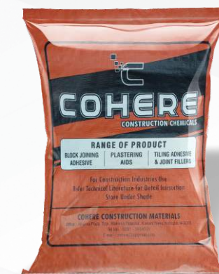
Block Jointing Adhesive